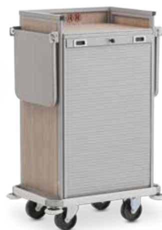
COFFEE STATION Plastic roll-down panel closed