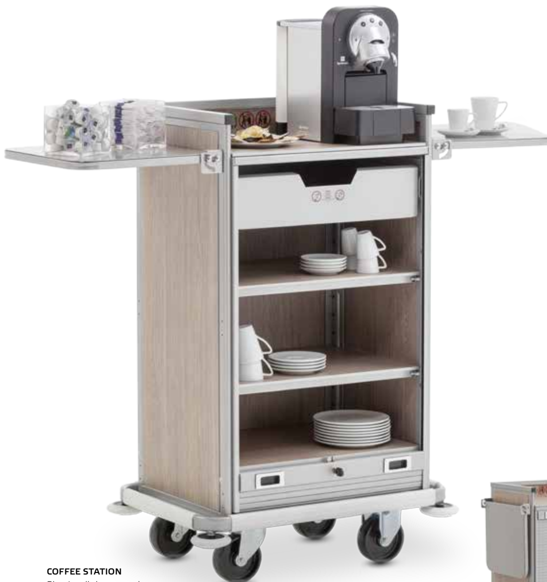
COFFEE STATION Plastic roll-down panel open