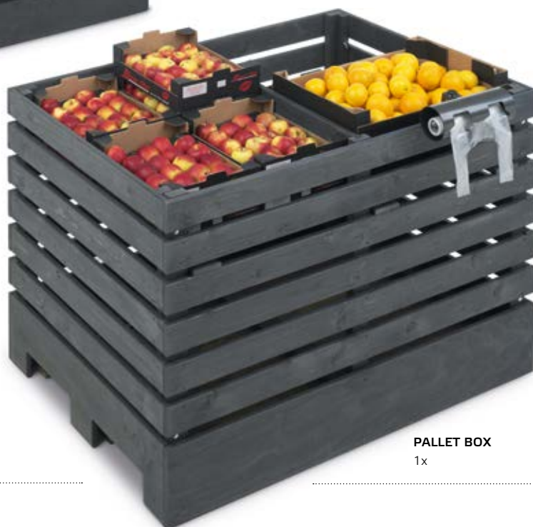
PALLET BOX 1x