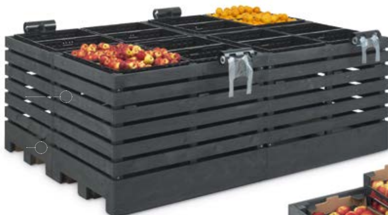
PALLET BOX 4x

> Lowlift transport also possible when loaded