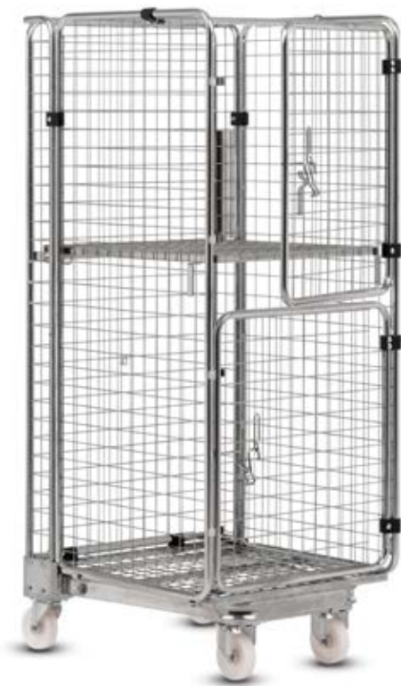
RC/N2 Basic model with hinged wire shelf (as standard)