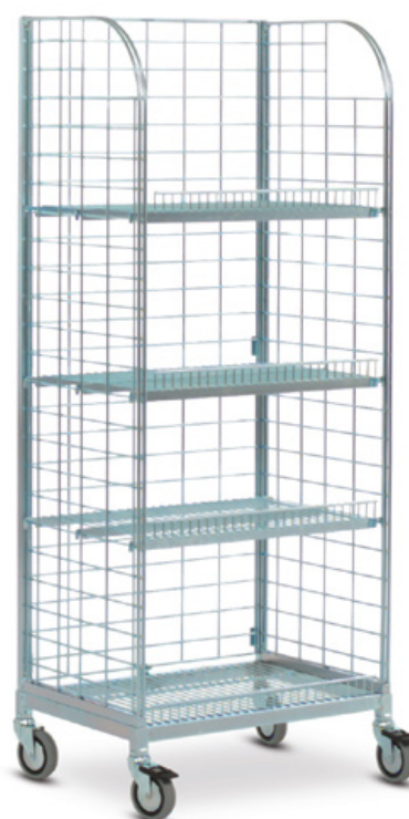
AD 300 D Mobile, chassis with accessories: 3 wire shelves

Design: solid, yet collapsible wire construction. Variable-use straight or inclined hook-in wire shelves. Easy to move with optional wooden pallet.