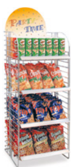
AD 200 8/6

■ The day-to-day needs of retail staff are well known to Wanzl as a partner to the retail industry. That is why we developed collapsible, space-saving special offer displays for successful product presentation.